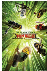
June 22: Ninjabo Payson Peteeetneet 100 S. 500 E.