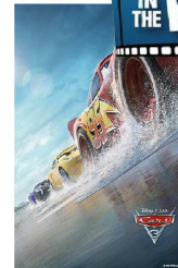
July 20: Cars 3 Santiquin City Center Park 100 S. 100 W.