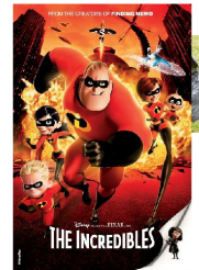
Sept. 14: The Incredibles Santiquin City Center Park 100 S. 100 W.

All movies start @ dusk. Pre-show entertainment @7pm