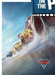
July 20: Cars 3 Santaquin City Center Park 100 S. 100 W.