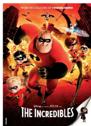
Sept. 14: The Incredibles Santaquin City Center Park 100 S. 100 W.

All movies start @ dusk. Pre-show entertainment @7pm