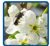
Attracting Native Bees March 9th, 7-8 pm