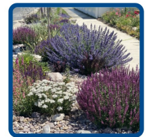
Creating Waterwise Park Strips March 19th, 10-11 am