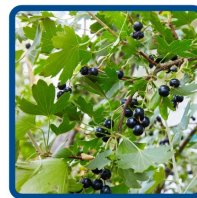
Edibles in the Landscape March 2nd, 7-8 pm