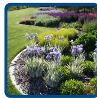
Planting Bed Design March 12th, 10-11 am